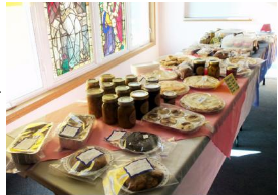
Just one of the tables of baking and preserves at the sale

Many hands make light work! Once again, many thanks to all who loaned us their hands.